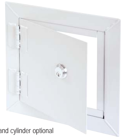
Lock and cylinder optional